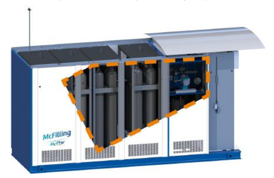
Figure 1: McPhy refuelling station (connection to stored hydrogen not shown)

Figures 1 and 2 provide an indicative refueller and site plan. These are subject to change dependant on the final site and equipment selected.